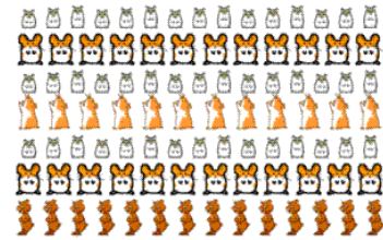
Figure 5: Screen capture of the original Hamster Dance site.

After the emoticon, other internet memes eventually followed and, as internet protocols became more sophisticated, so did internet memes—especially with the development of the World Wide Web (WWW) in 1991, which allowed users to network in graphical environments. By 1998, personal computers were affordable and the WWW had exploded with more than 150,000,000 users (“Internet Growth Statistics - the Global Village Online,” n.d., “Total number of Websites - Internet Live Stats,” n.d.) experimenting with ways to communicate and connect with one another through online communities such as GeoCities, where everyday folks were able to build their very own websites. In August, Deidre LaCarte, a Canadian art student, built a GeoCities site called “Hamster Dance” and, although it didn’t gather much attention for the rest of the year, it suddenly got noticed in 1999 and began logging as many as 15,000 views per day (Davison, 2012, p. 125). As a result of this phenomenal and surprising success, many consider it to be the first truly viral internet meme on the World Wide Web.