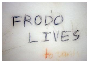
Figure 3: "Frodo Lives!" graffiti in a public bathroom

More recent pre-internet memes include Kilroy was Here , which probably originated somewhere between 1937 and 1939 (Wikipedia, 2014b) and Frodo Lives , which was originally scrawled on a New York subway train in 1965 to pay homage to a recurring