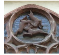
Figure 2: Window of Three Hares in Paderborn Cathedral

and countless other memes have emerged over the centuries, including the expression abracadabra in the 2 nd century A.D. (Wikipedia, 2014a), and The Three Hares during The Sui dynasty from 581–618 A.D, which is considered to symbolize the trinity when used in Christian churches. (Wikipedia, 2014c)